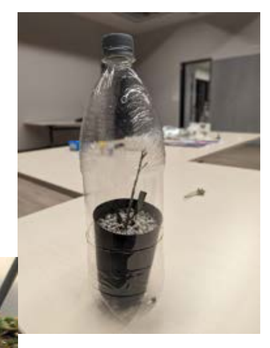
'Dome' pictures by Tony Hughes

Examples of domes for the capillary pots which could sit on wet geo textile fabric.